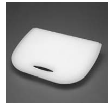
AC24 Synthetic Preparation Board