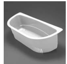
AC72W 'D' Colander